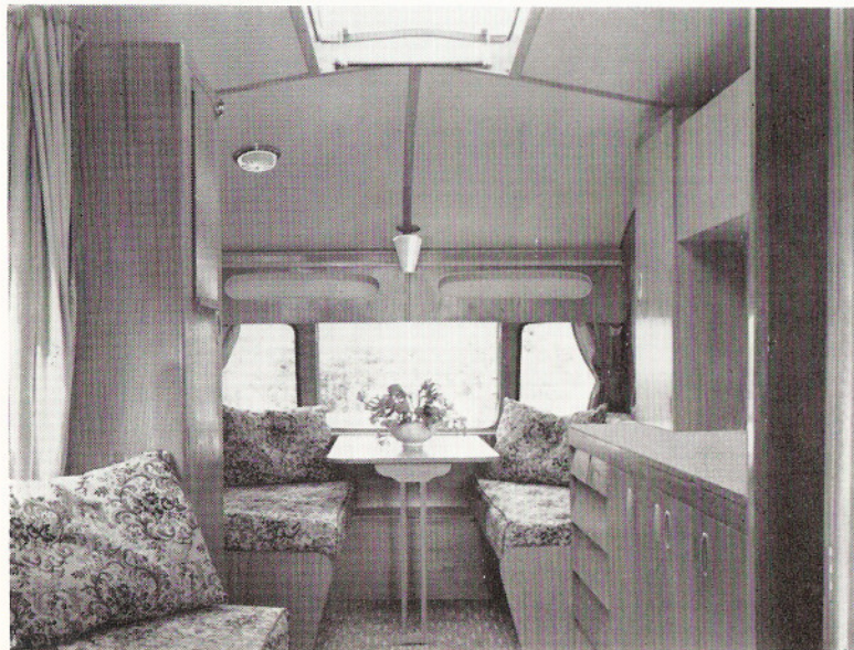
Interior of Nyala looking to front of van