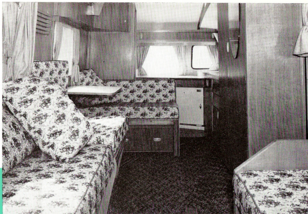
SPRINGBOK—views of the interior. The refrigerator shown in the rear view (above) is an optional extra. The chest and hinged table can be seen in the front view (below).

Ex-works weight: 17½ cwt. (902 kg) Overall size: Length 18' 7" (566 cm) Width 6' 9" (206 cm) Height 8' 1" (246 cm)